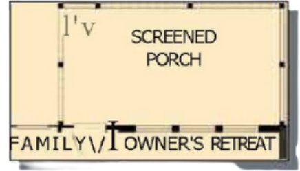
OPTIONAL SCREENED PORCH AT FAMILY